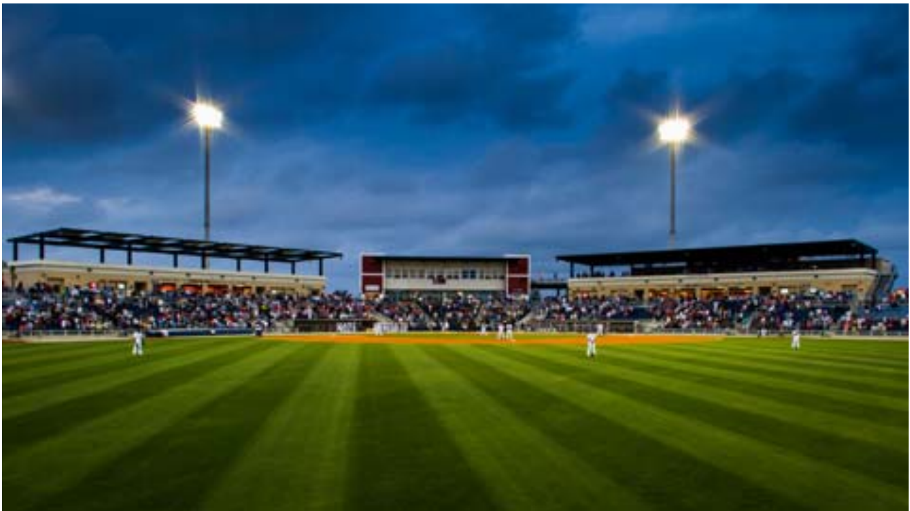
Pensacola Blue Wahoos Playing at the Maritime Park Stadium