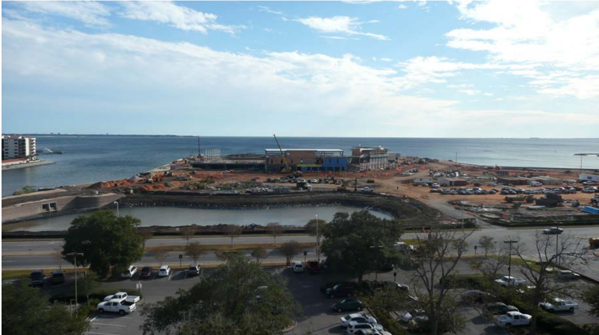
Project Under Construction

Construction of the stadium and related infrastructure was completed in March 2012. Construction of the amphitheater was concluded in June 2012 and the breakwater construction on the southwest corner of the property was completed in October 2015.