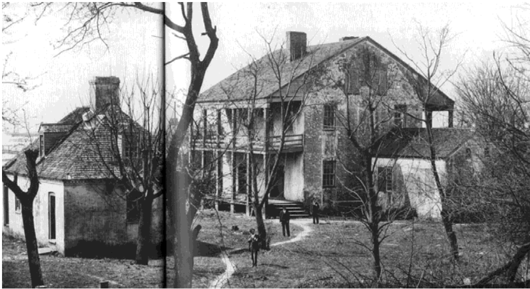
Panton-Leslie Trading Post, located on the Maritime Park property, circa 1850's

The Vince Whibbs, Sr. Community Maritime Park is a master planned, public/private, urban renewal project on a former industrial, 32-acre parcel located on Pensacola Bay, in Pensacola, Florida. The property, significant in the city's unequaled 450 years of history, was utilized as the Panton-Leslie trading post as early as 1784. The peninsula saw many expansions and changes in use as the Pensacola waterfront evolved. Last utilized in the 1980's as a petroleum depot and sea-to-rail transfer station, the site sat fallow for over 30 years. The City of Pensacola acquired the property to ensure a public use for the site. The Community Maritime Park project was approved by the Pensacola City Council in 2005 and affirmed, via referendum, in September 2006. Since that time, project professionals have designed, permitted and constructed the elements of the project.