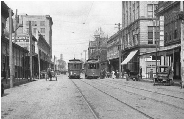
Early 1900s, Palafox Trolley

The proposal outlines strategic modifications to the mobility networks in the Hashtag area, including traffic changes, a complete and connected bike network, and strategic curb modifications to better accommodate pedestrian circulation, bioswales, and planting. In addition, the proposal outlines a signature palette of paving materials, street furniture, and plant communities that will create a distinct landscape for the Bayfront area. The proposed Hashtag Connector Plan prioritizes users in Street Design. Pedestrians are given priority with the design of friendly sidewalk spaces, resting spots, shade, and active storefronts.